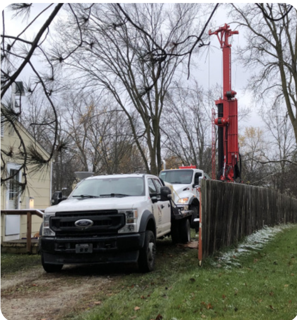
Geothermal rig at the Bryant Community Center drilling the vertical wells for the Center's geothermal heating and cooling system.

UPDATES AND PROGRESS. Over the past year, since our last OSI newsletter covering the Bryant project in November of 2023 , tangible and exciting progress has been made! By the end of 2024, this initiative has helped more than 35 households receive home repair and efficiency upgrades through the State MI-HOPE program and County Weatherization Assistance Program, and funding has been secured for more than 50 additional homes to make improvements through those and related programs for 2025. Progress has also been made at the Community Center itself, as the first portion of the building's geothermal system was installed in November. In addition to these physical upgrades, 2024 was also a huge year for fundraising and project development.