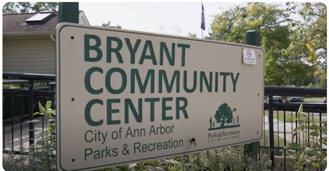
A still from the video produced by the McKnight Foundation.

An excerpt from the Time Magazine article "The Rise of Carbon-Neutral Neighborhoods".