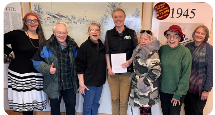
OSI staff with residents, board members, and committee chairs from Pittsfield Village, take a group photo after adopting Standard Operating Procedures, which will guide the collaboration. Dec 2024.

The heart of Pittsfield Village lies in its residents – a vibrant, passionate, resilient, and engaged community. Many residents have been engaged in pursuing and supporting the A 2 ZERO plan, with resident-led groups focusing on expanding Pittsfield Village's sustainability efforts and community leadership that is eager and enthusiastic about the transformations this collaboration can bring to the neighborhood. The collaboration began in large part because residents and community leaders reached out to OSI at the end of 2023 to learn about how to get more involved in climate action and advance sustainability initiatives in the community. For these reasons, Pittsfield Village and OSI are well-positioned to collaborate on a long-term neighborhood decarbonization and sustainability effort driven forward and led by the community.