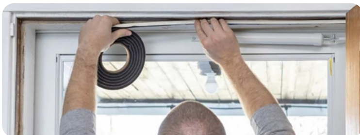
Application of weatherstripping to door frame.