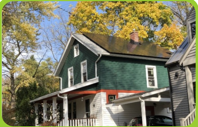
Ann Arbor home generating its own clean energy via solar panels.