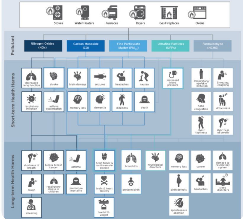
Overview of health impacts from exposure to pollutants from fossil fuel combustion.

In the home, appliances that burn fossil fuels, such as water heaters, furnaces, stoves/ovens, clothes dryers, and gas fireplaces emit several health-harming pollutants. It is well-documented that exposure to these pollutants over both the short and long term can have serious health impacts.