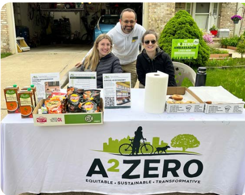
A 2 ZERO Ambassadors directing the Fox Fire Neighborhood Swap Day.