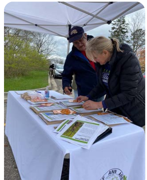
A²ZERO Ambassadors managing the pick-up zone during an OSI spring free-tree giveaway.

During their trainings, A²ZERO Ambassadors learn about a wide variety of topics such as principles of equity and environmental justice, climate change, renewable energy and efficiency, urban water systems, transportation and choices about