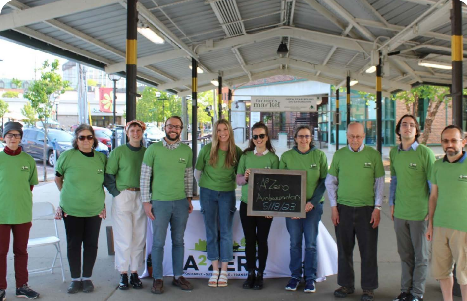
Our 4th cohort of A²ZERO Ambassadors celebrating the completion of their training at the Ann Arbor Farmer's Market.

VITAL COLLABORATORS IN ACHIEVING COMMUNITY-WIDE CARBON NEUTRALITY