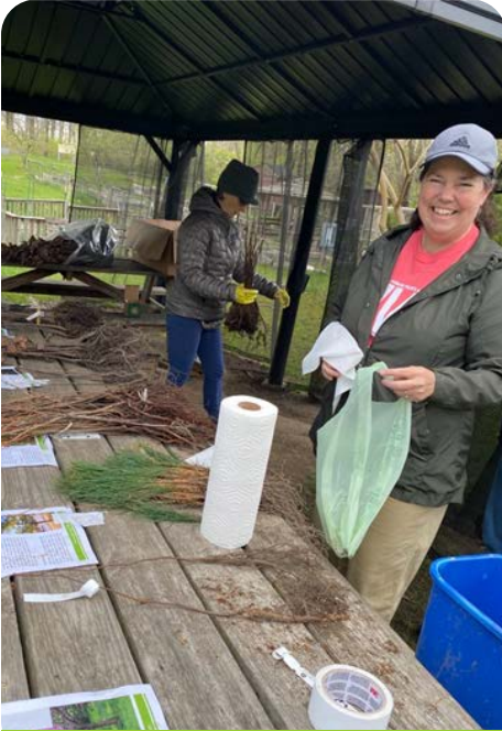
Ambassadors wrapping up various tree saplings during a free-tree giveaway.

VITAL COLLABORATORS IN ACHIEVING COMMUNITY-WIDE CARBON NEUTRALITY