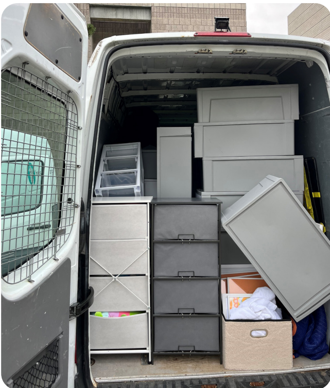
The van loaded with donations.

To learn more about House N2 Home, visit their website , follow them on Facebook and Instagram , or send an email to: ContactUs@HouseN2Home.org .