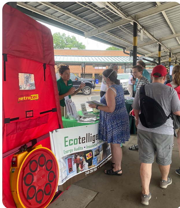
A blower door that is used in a home to conduct an energy assessment.

Another way to advance a building’s efficiency is by understanding all the devices and appliances that use energy, taking an inventory of each device for both efficiency and age of the appliance, and working out a replacement plan to upgrade to ones that use less energy. The simplest demonstration of what a difference this can make is to look at a furnace. Consider an older furnace that has an 80% efficiency rating and a newer furnace that has a 95% efficiency rating. The difference between efficiency ratings will result in 15% less energy needed to heat the home. That energy efficiency gain is even more significant with a heat pump which can have a 200-300% efficiency rating! This concept of upgrading to more efficient appliances goes for all appliances in your home or business that use energy.