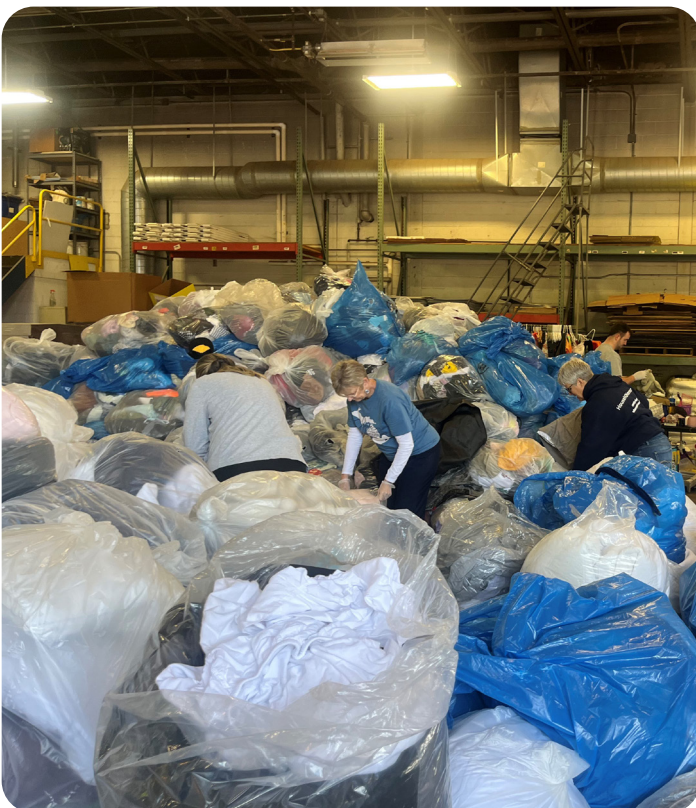
The House N2 Home warehouse where donations are sorted.