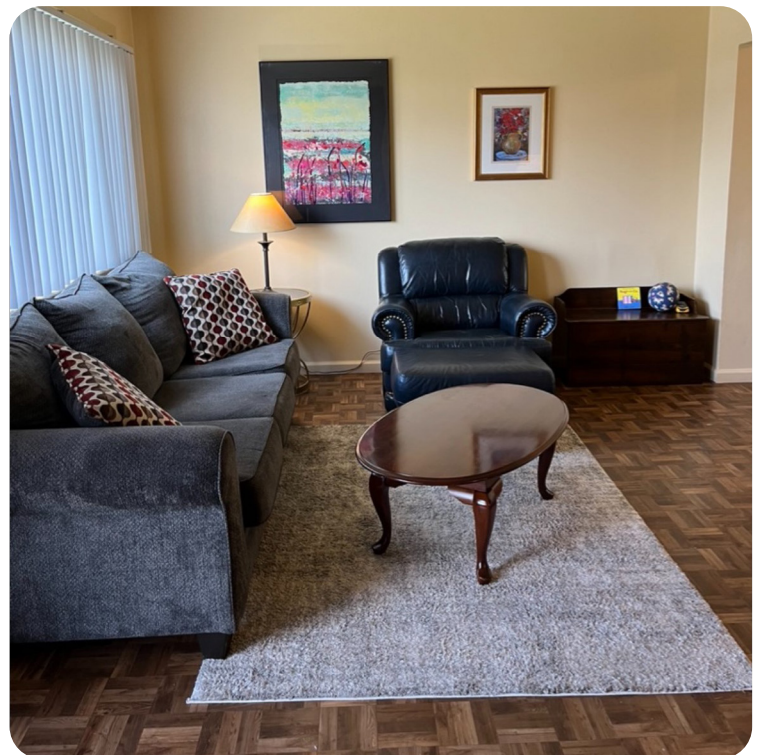
A living room furnished with donated furniture.